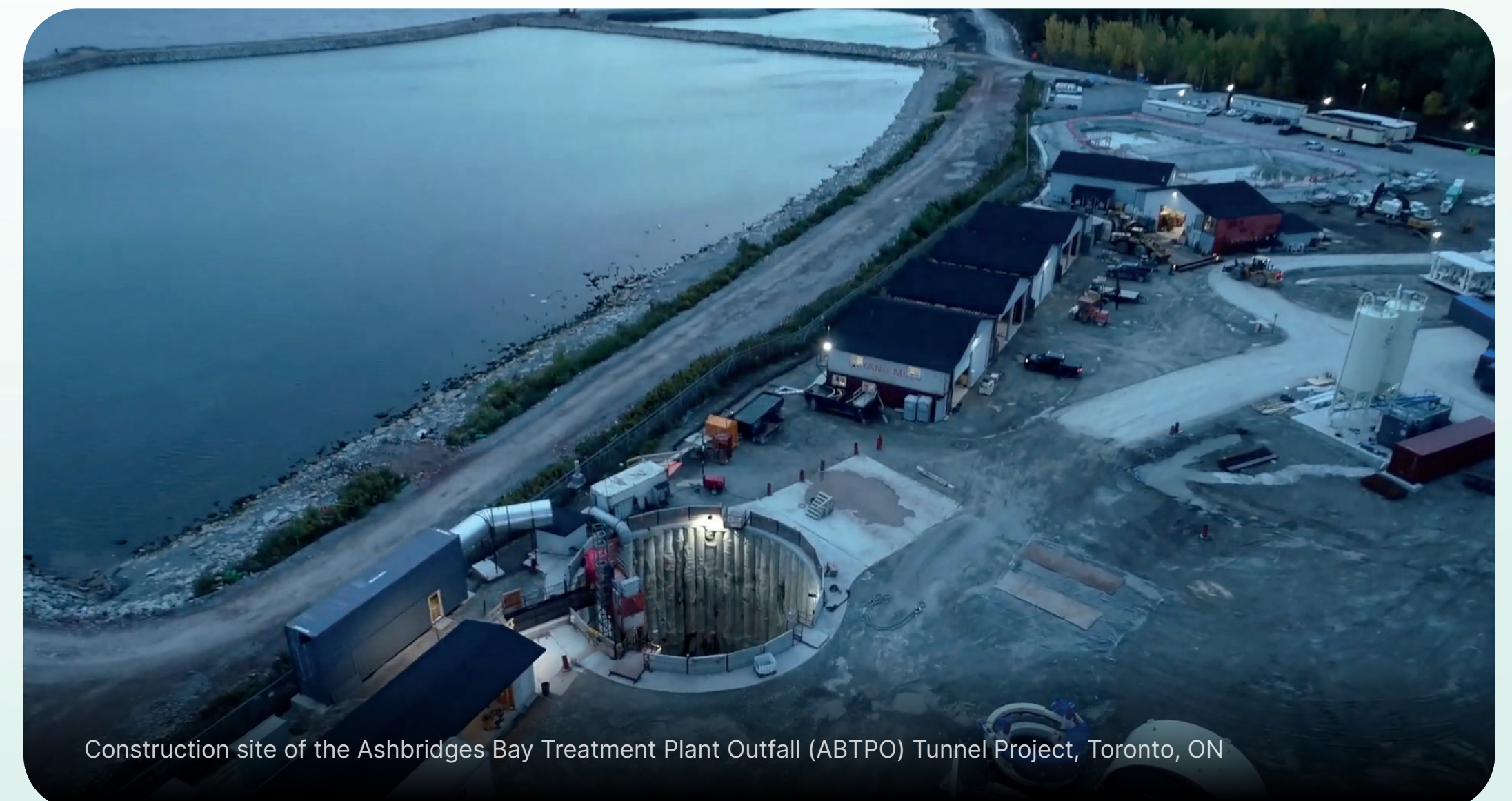
Construction site of the Ashbridges Bay Treatment Plant Outfall (ABTPO) Tunnel Project, Toronto, ON

For the next generation, it will also be a satisfying time for those who are interested in research and teaching. Universities across Canada are now graduating young students in every aspect of tunnelling and underground space development. Maintaining an adequate supply of capable graduates will provide inspiration for close cooperation between universities and various business sectors throughout Canada.