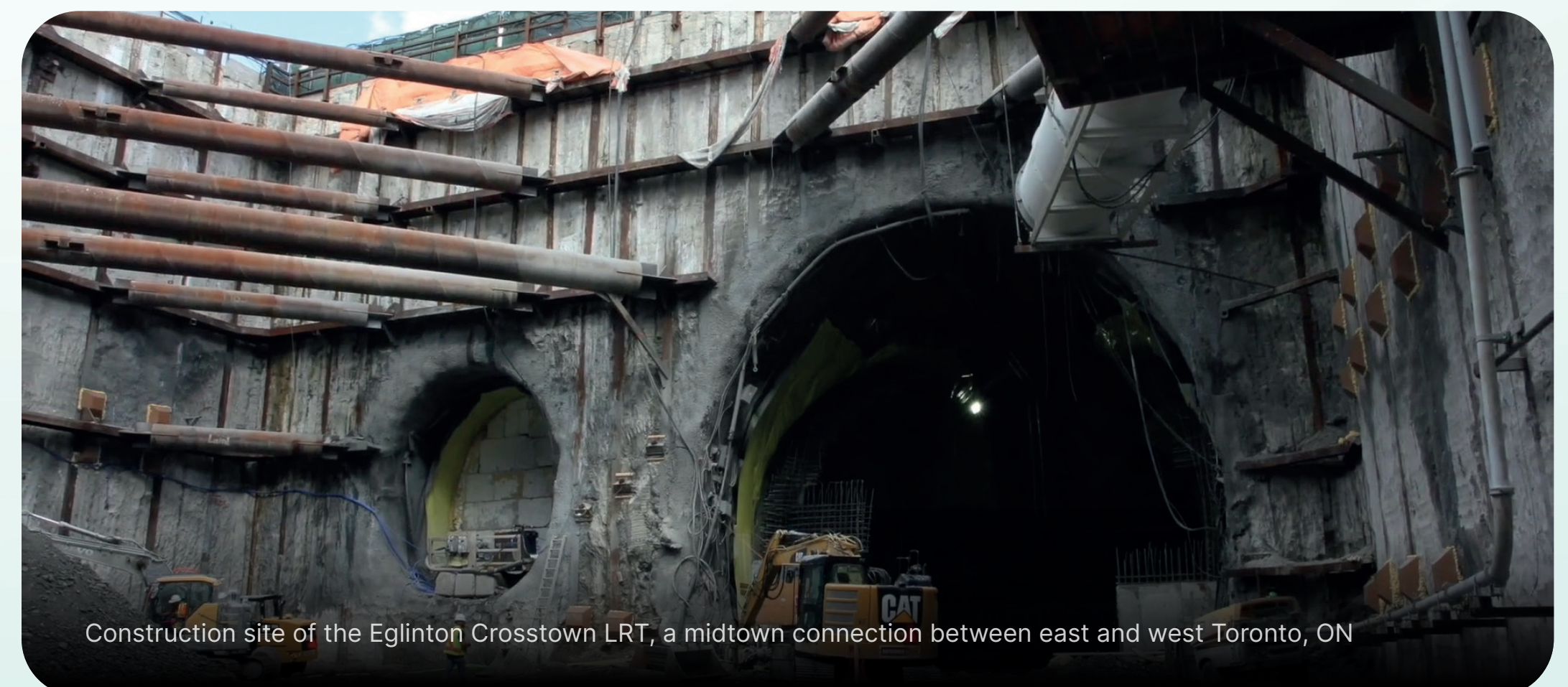
Construction site of the Eglinton Crosstown LRT, a midtown connection between east and west Toronto, ON

The organisation holds its General Assembly Meeting and the World Tunnel Congress (WTC) in a different Member Nation, each year. ITA had 1974 when founded 14 Member Nations and has since grown steadily and includes today 79 nations and 260 Corporate or Individual Affiliate Members. An impressive number and shows the importance of the industry.